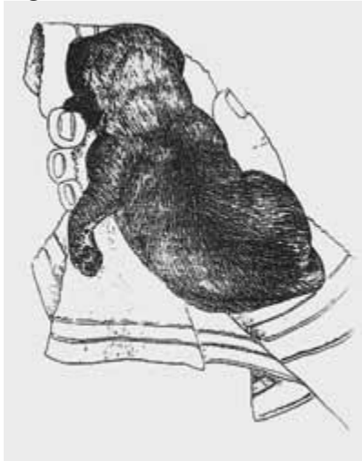
Figure # 5 Thermal stimulation )

These five exercises will produce neurological stimulations, none of which naturally occur during this early period of life. Experience shows that sometimes pups will resist these exercises, others will appear unconcerned. In either case a caution is offered to those who plan to use them.