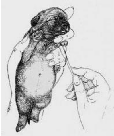
Figure # 1 Tactical stimulation)

2. Head held erect: Using both hands, the pup is held perpendicular to the ground,