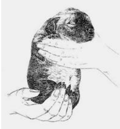
Figure # 2 Head held erect

3. Head pointed down: Holding the pup firmly with both hands the head is reversed and is pointed downward so that it is pointing towards the ground. Time of stimulation 3 - 5 seconds